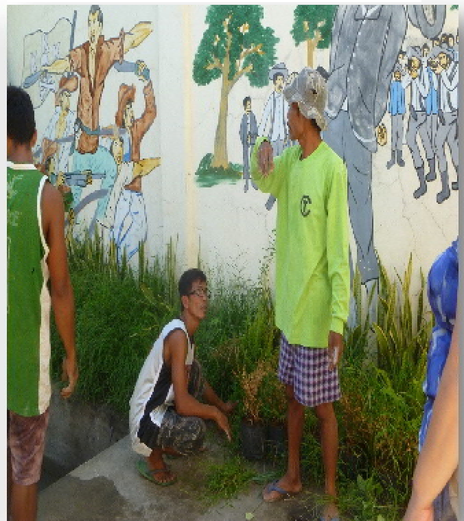
Farmers group clears the tall grass near the agricultural creek inside the school.