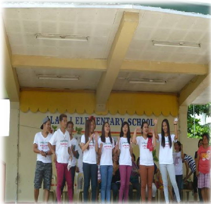
Task Force Kabataan yells for the roll call