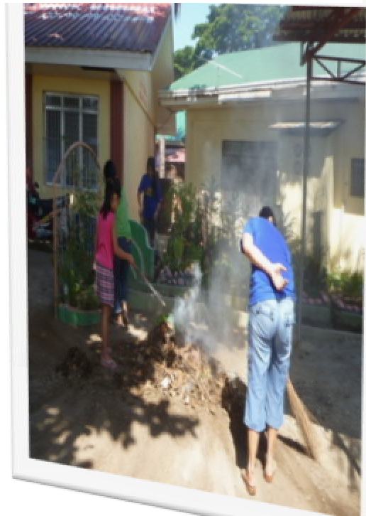
Parents sweep the ground.