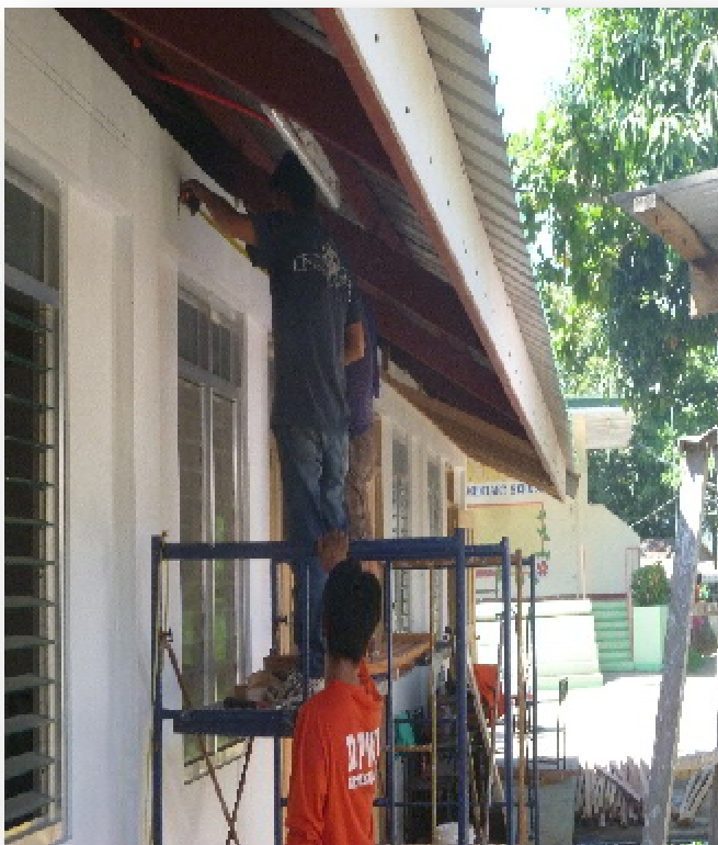
Tricycle Drivers and Operators paint some rooms